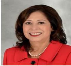
Hilda Solis First District